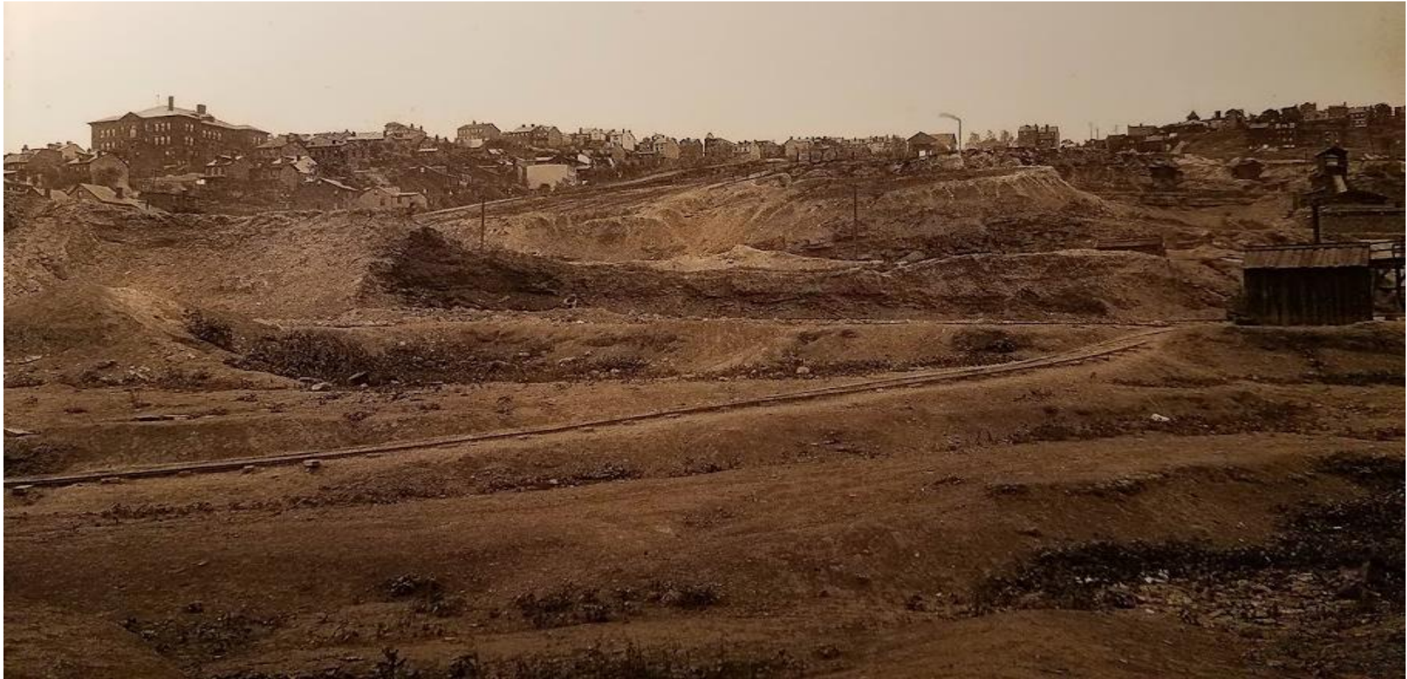
We've come a long way! 1910 photograph of South Side Park plateau area after industry left its mark. The narrow gauge railroad tracks are in the foreground. (provided by Bill Landon).