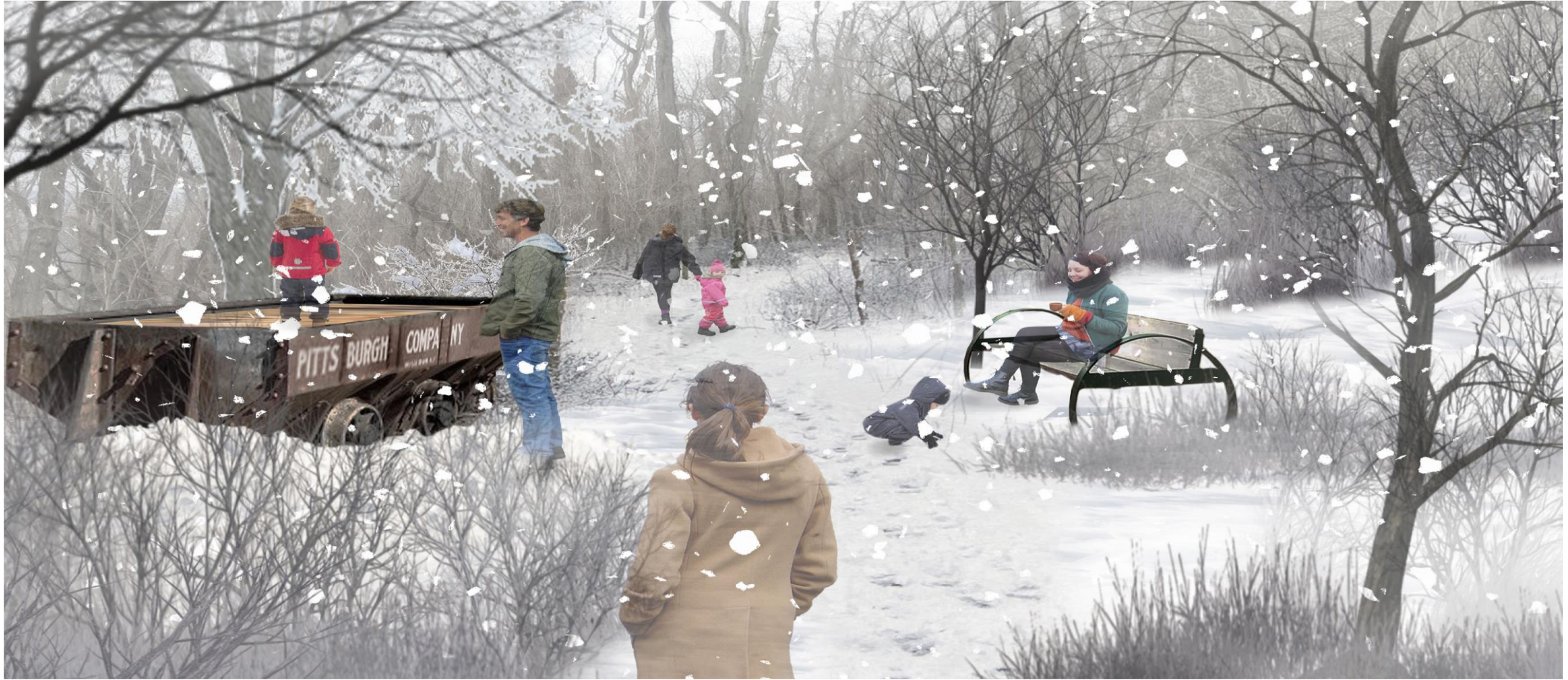
Perspective rendering (Studio Bryan Hanes) from the South Side Park Master Plan showing a coal car viewing deck as an example of historic interpretive art that could be placed along the Keeling Coal Trail.