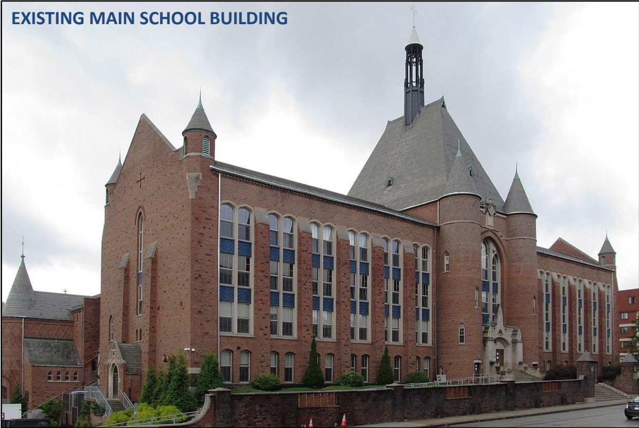
EXISTING MAIN SCHOOL BUILDING