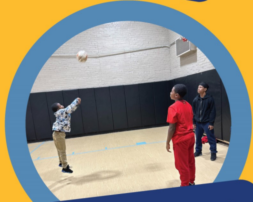
Fun with Friends!