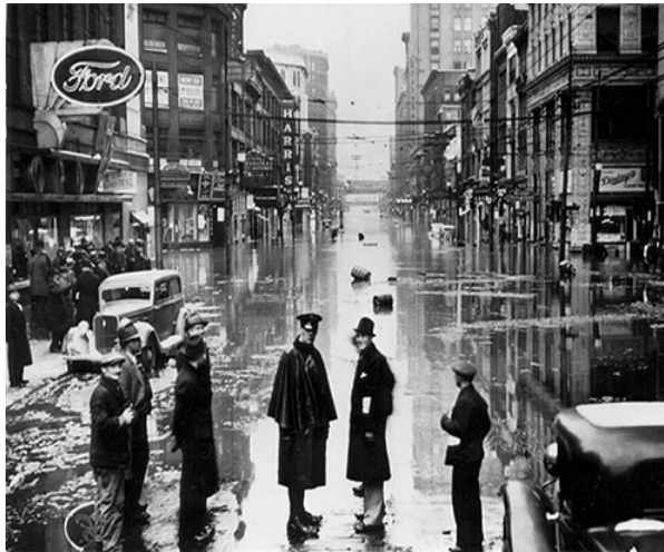
Pittsburgh Flood of 1936

http://www.pittsburghcoalitionforsecurity.org/